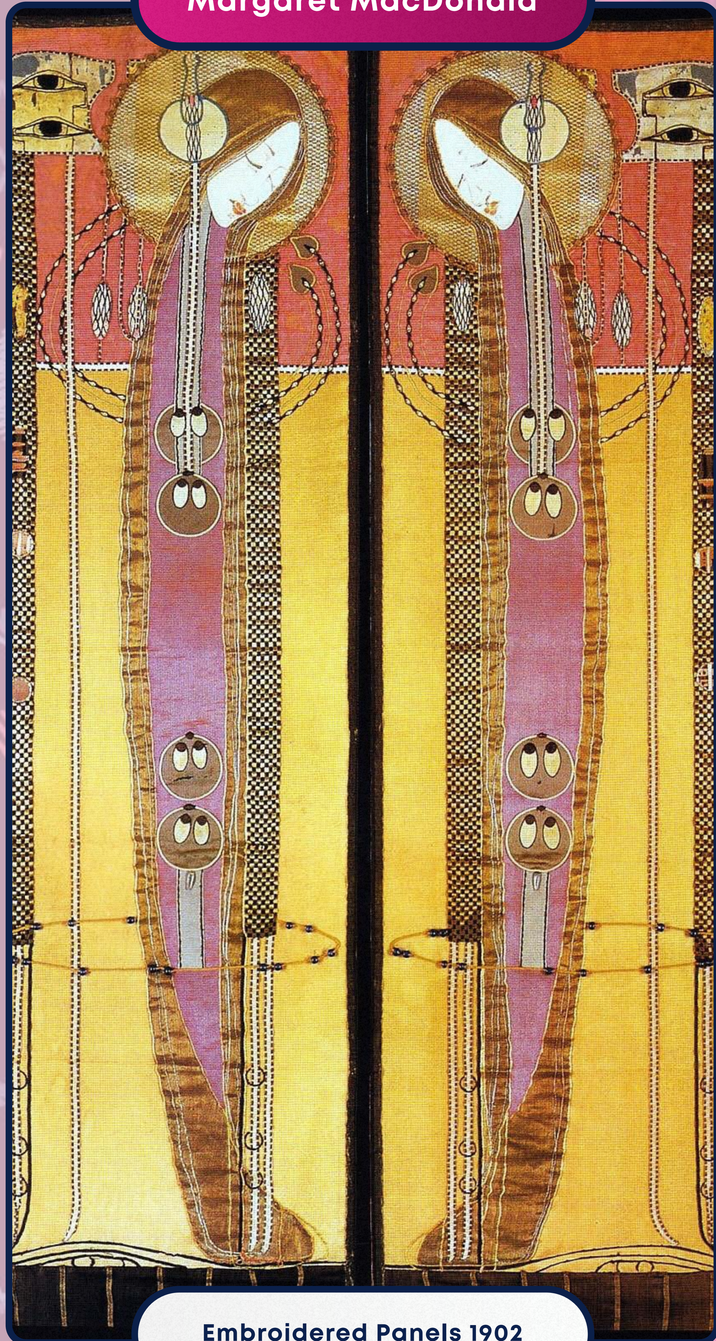
Embroidered Panels 1902