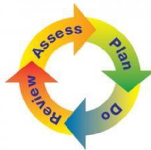
(The Graduated Approach)